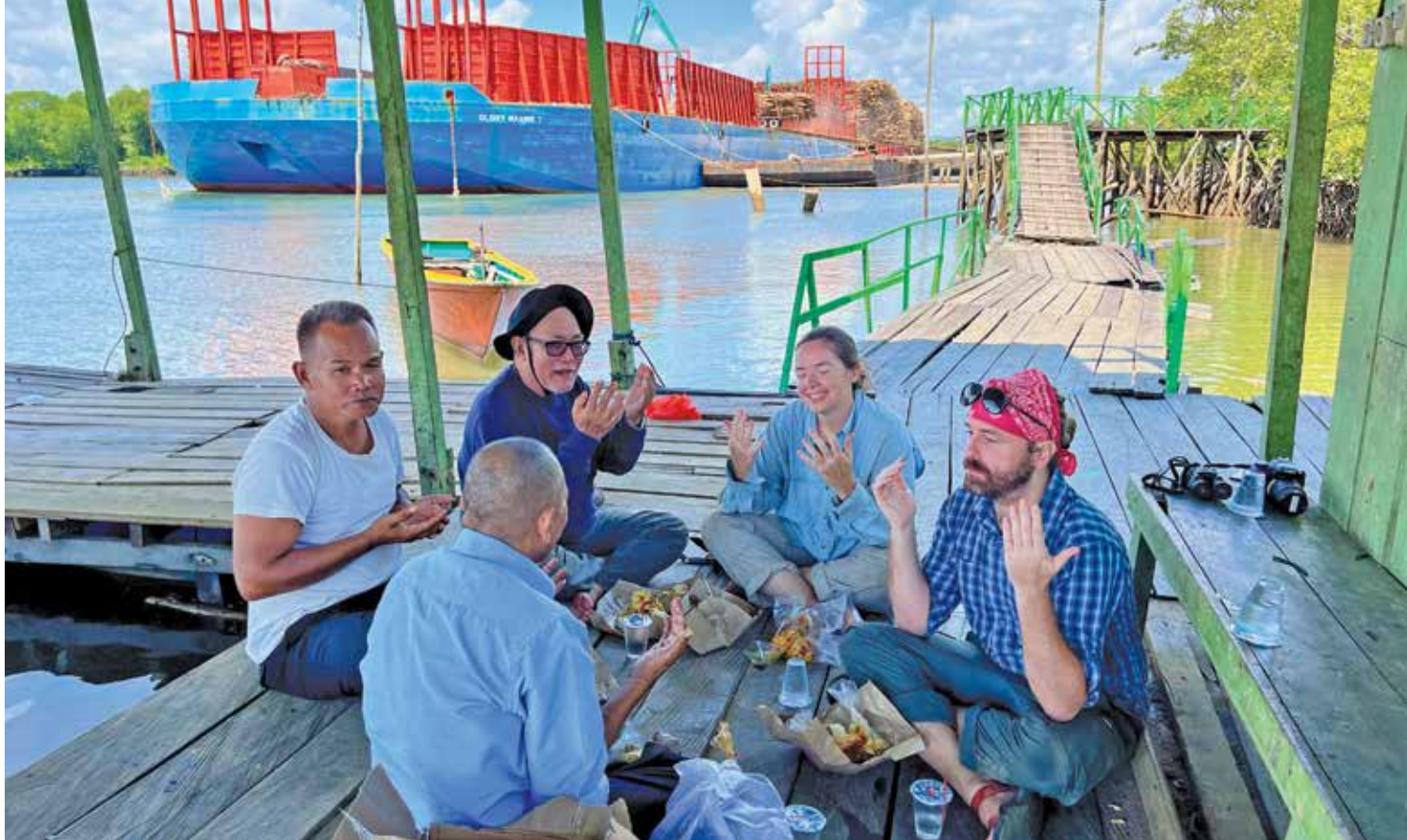
The authors and community research partners pause for a brief pre-lunch prayer next to a dock where eucalyptus logs are loaded for shipment down Balikpapan Bay to other islands in the archipelago (photo by Rizky Ramadani).

anthropology, thereby engaging soundscapes as perceived and experienced by local people, we hope to uncover previously unseen (and unheard) understandings of landscapes.