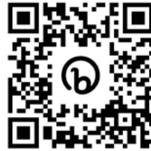
Audio: Black hornbill ( Anthracoceros malayanus ) recorded in UNMUL's Lempake Education Forest, a 100-ha parcel of forest located on the edge of Samarinda city (recording by Wendy Erb).

for passive acoustic monitoring shone brightly. In fact, ideas are already percolating for multiple thesis projects for the recorders we deployed in the university's education forest – a small parcel on the city's edge where, in a 24-hour period, we recorded a surprising number of threatened species (listen to audio above) – and across the broader Nusantara landscape. Through the magic of Zoom, I'm also able to stay connected with a network of research teams across the archipelago – from Peninsular Malaysia to Papua. As one of the co-founders and mentors of the Yang Center's 'Bioacoustics Equipment, Training, and Mentorship Program,' I have the honor of learning with inspirational leaders from local universities and NGOs and supporting their efforts to establish exciting and impactful conservation research. Together, we are imagining and co-creating a more inclusive bioacoustics, where local people pursue culturally-appropriate solutions to conservation problems that they are uniquely positioned and qualified to solve.